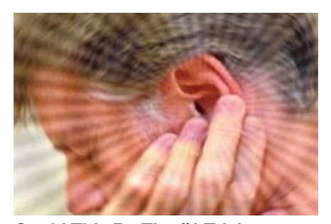
Could This Be The #1 Trick to Reverse Hearing Loss (Do This Tonight)