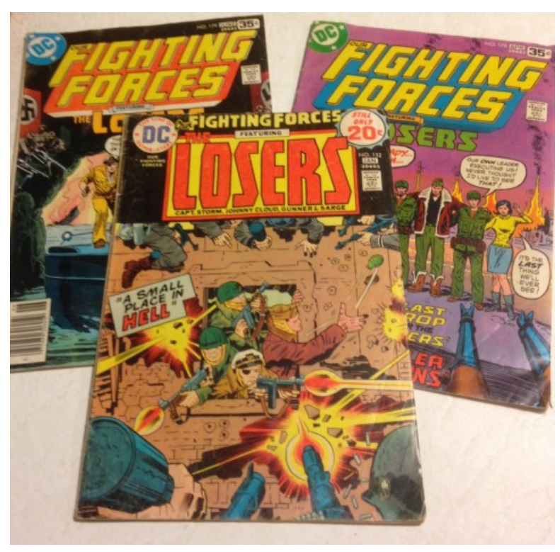
We have our heroes, too: This week's second prize, from 1974 and 1978.